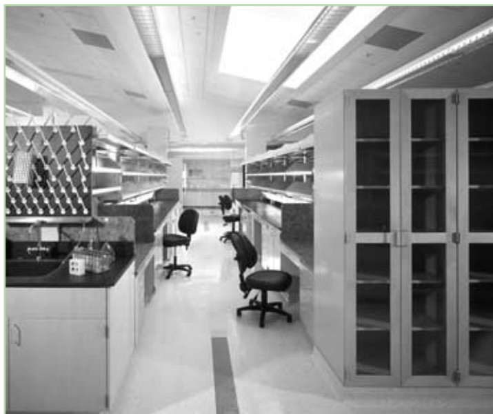
One of BSRI's new state-of-the-art laboratories.